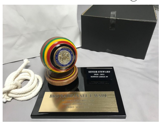
Token of Gratitude and Remembrance